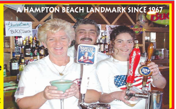
A HAMPTON BEACH LANDMARK SINCE 1967

Kids Menu Available — Eat in or Take Out